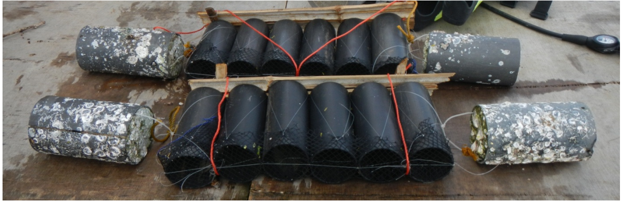
Figure 1: Construction used to release the groupers after the predator-avoidance experiments.

During transportation of the constructions from the raft to the release location some groupers escaped. The bamboo lit was supposed to prevent this from happening, however the groupers managed to escape through small gaps between the bamboo and the tubes when the construction bended. Again, after approximately 24 hours the lit was removed and the behaviour of the groupers was observed for two days both in the morning and afternoon. Coral structures were used to conceal our presence from the groupers to some extent after they were released. The second monitoring day was mainly spend in order to relocate the grouper juveniles that were released by scanning the surrounding reef environment.