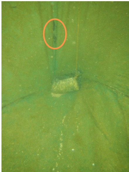
Figure 8: Predator setup corner 2

Both experimental setups had one individual that swam from one corner to another. This is a low amount compared to observations made in the previous week.