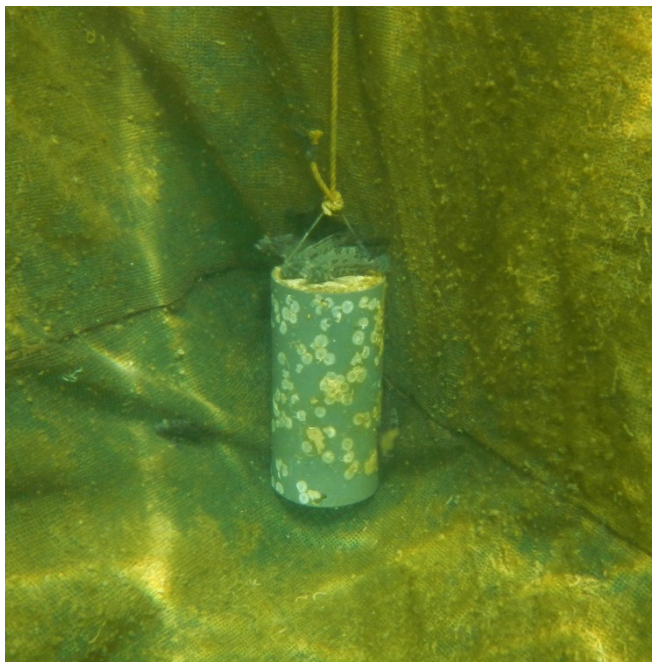
Figure 10: Predator setup corner 1

Within the predator setup clear differences in behaviour were noticed between the different corners. In corner 1 fish were lying quietly on the bottom or weight (fig. 10). In corner 2 fish were aligned in the corner, however there was little activity and most remained in their place unless disturbed (fig. 11). There was also a difference in the colour that was displayed between the two corners: in corner 1 the groupers had a grey colour with dark blotches, while in corner 2 they were completely black.