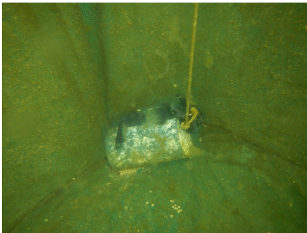
Figure 6: Predator setup corner 2

The predator setup had one grouper individual swimming close to the surface. This looked similar to the gulping behaviour described at 24-10 and this grouper showed limited response to my presence. The control setup had multiple individuals approaching the surface, however their behaviours were not different from groupers swimming on the bottom. They would also immediately swim away when I came too close to them and they never stayed at the surface for longer time periods.