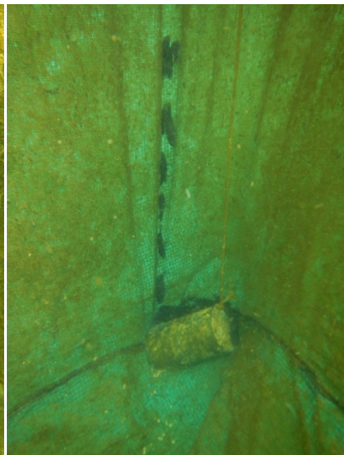
Figure 11: Predator setup corner 2

The same applied to the control setup, where groupers in corner 1 were either lying on the bottom around the weight or on the weight itself, while in corner 2 groupers were present higher in the water column than in the other corners. Groupers were also more abundant in corners 1 and 2 compared to corners 3 and 4 in both setups. Although sometimes groupers were present in corners 3