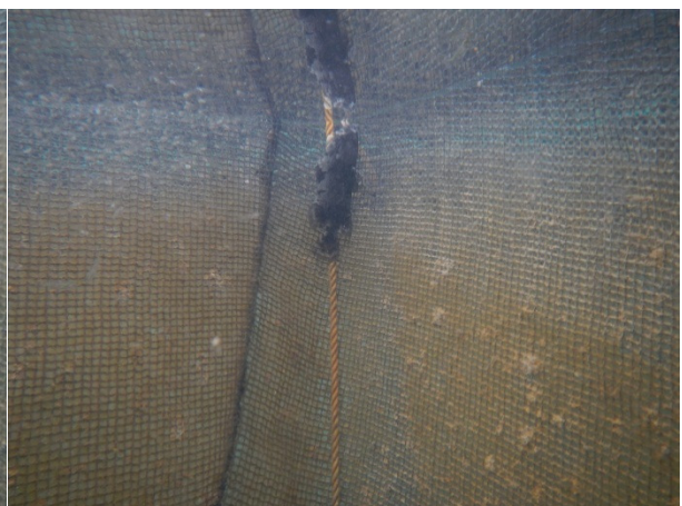
Figure 5: Gulping behaviour displayed by the grouper fingerlings, predator setup corner 3