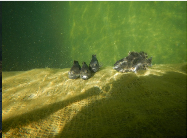
Figure 3: Schooling behaviour displayed by the grouper fingerlings shortly after release.