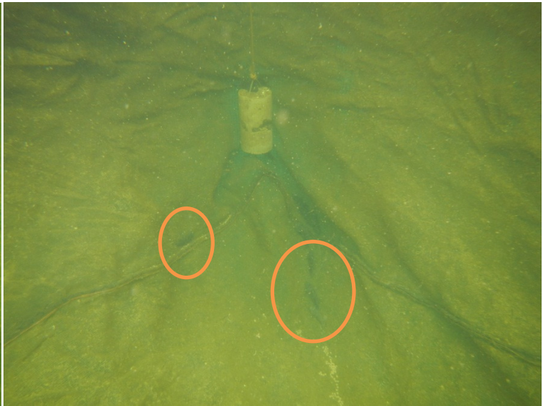
Figure 9: Control setup corner 1