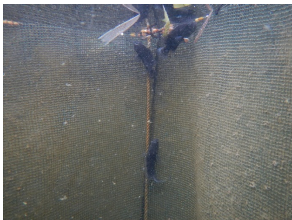
Figure 4: Gulping behaviour displayed by the grouper fingerlings, predator setup corner 4

In the afternoon some groupers displayed a new behaviour: they were gulping at the surface, as if trying to breath air (fig. 4 & fig. 5). Staying at the surface makes the groupers prone to predators, such as kingfishers and herons, which both were observed to use the metal frameworks to hunt for food. When the predator was released, the grouper juveniles did not display any predator-avoidance behaviour.