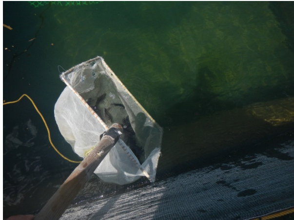
Figure 2: Scooping net used to release the grouper fingerlings

After the groupers were released in the cage they typically displayed schooling behaviour (fig. 3). They all avoided the open water, and most of them were lying against the edges or on the bottom of the cage. When they were alone, they often went to other conspecifics as fast as possible. Exploring behaviour was very low, and most groupers either stayed close to the place where they were released, or swam to the deeper parts, especially the darker corners.